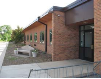
St. Richard's School Now Blessed Trinity's Penn Campus