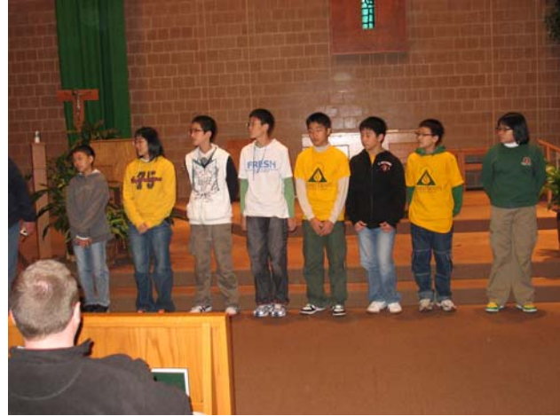
The Korean exchange students are introduced to the Blessed Trinity student body before the Marathon for Non-public Education on Sept. 29th.

Blessed Trinity is excited to have these students as part of our student body. Our students gain so much by having friends of a different culture who live on the other side of the world!