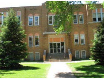
St. Peter's School Now Blessed Trinity's Nicollet Campus