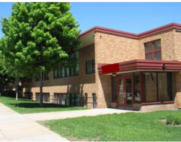
Assumption School Facility currently being rented to an outside group.