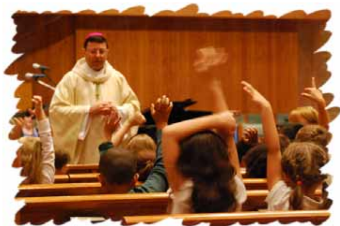
First all-school Mass (September 15, 2010) at St. Richard's Church with Bishop Piche' presiding. What a treat for the students!